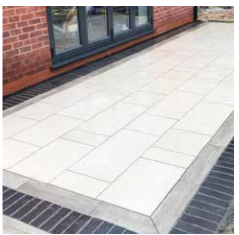
Y ProJoint™ Porcelain Grout in neutral/buff